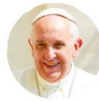
Pope Francis @Pontifex

https://pay-payzone.easypaymentsplus.com/customer/10250/product-list/